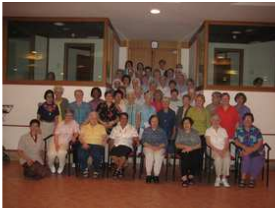
(a) The word “Work” means “Charism” of Sion, the salvation of Israel.